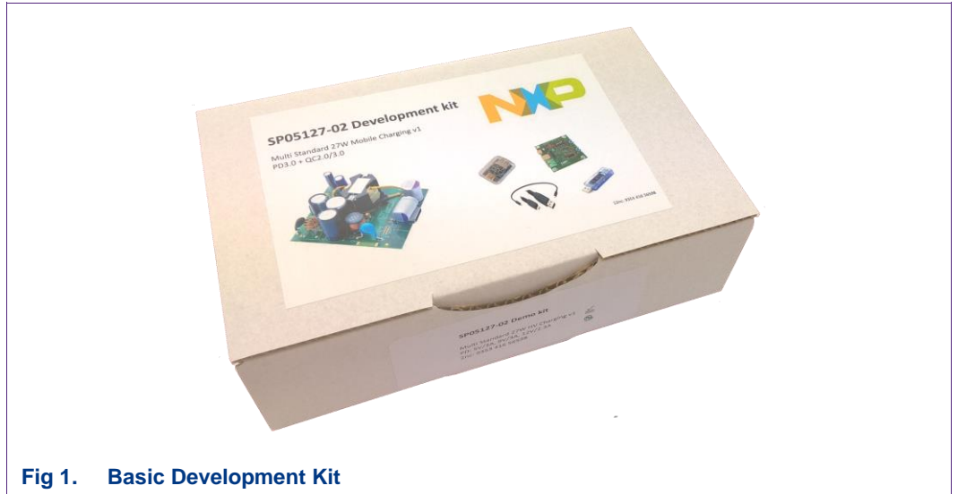
Fig 1. Basic Development Kit